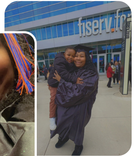
N & E