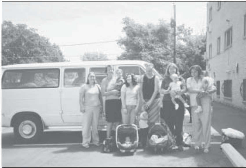
Residents loading up for a trip to church

How are we able to provide transportation for a group of residents and their children?