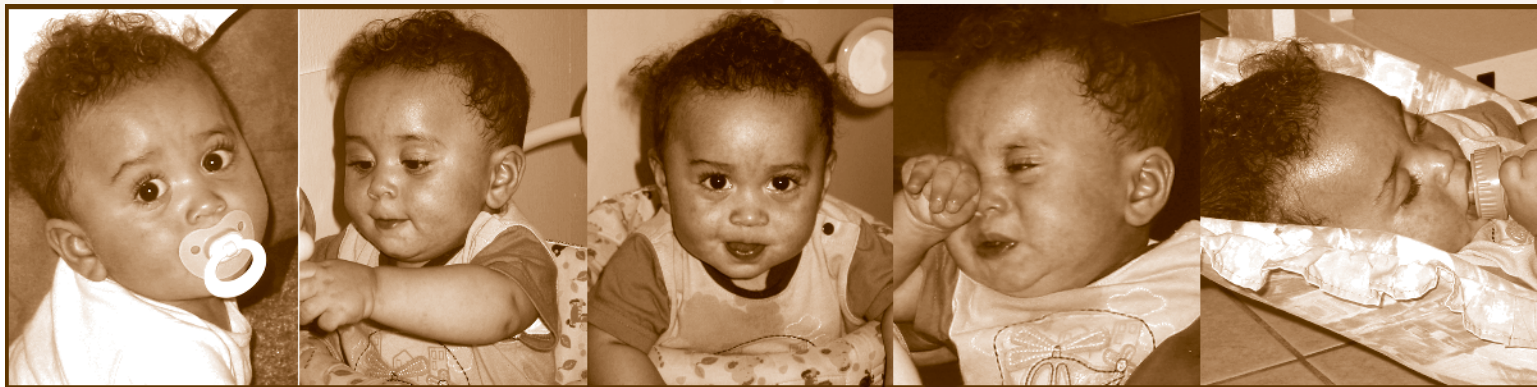
table. It’s fun to suddenly let out a scream at the table. Everyone laughs. I laugh too though sometimes I feel a little silly. I even make my poor Mom feel a little silly with my noises.

It’s fun where we live. There’s a little