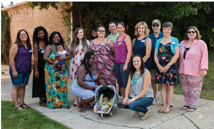
Pictured: Mothers, children, and New Beginnings' staff and board members

Thank you to everyone who attended our Ice Cream Social this year! We had a wonderful time. Save the date for next year! Saturday, August 18, 2018 | 1:30pm-4:30pm